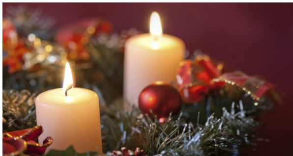
Hanging of the Green—Tonight at 5:00 Food & Fellowship afterward.